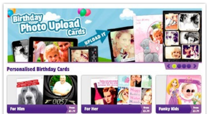
Photo upload, another DirectSmile feature, soon became of equal importance. Richard Pepper comments: "As the market developed, using customers' photos in our products became increasingly popular. Today, close to 50% of our orders include photos that visitors upload to our portal."

Using photos and personalized images attracts customers